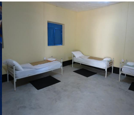
Isolation ward after renovation