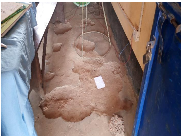
Isolation ward before renovation